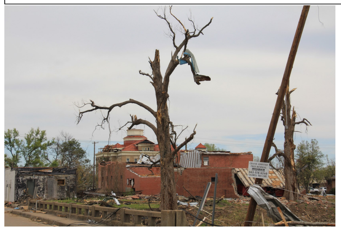
The Sharkey County Courthouse, in background, is surrounded by destroyed buildings.