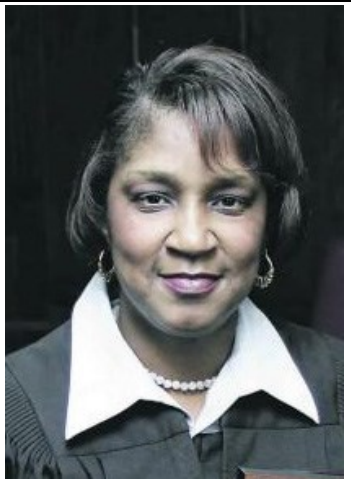
Judge Vernita King Johnson