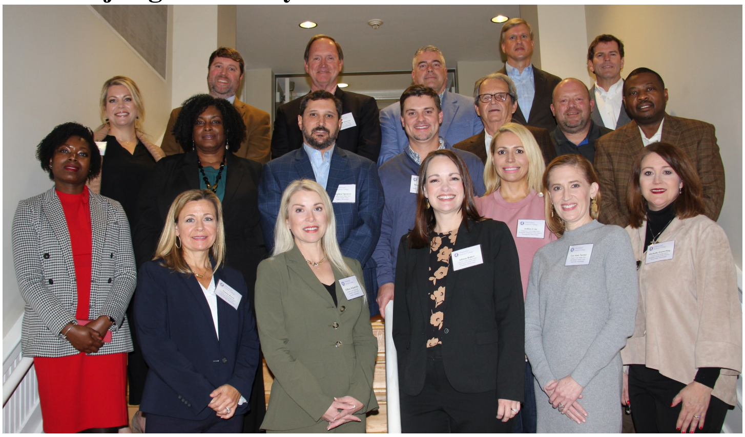
Newly elected judges gathered for a group picture at the University of Mississippi School of Law on December 5, 2022. Several judges who were appointed earlier also participated in training provided by the Mississippi Judicial College.

Twenty-one new trial court judges have taken the bench since January 1. November 2022 elections brought 19 new judges to the bench, and there were two appointments to fill vacancies. There are three new chancellors, nine new Circuit Court judges and nine new County Court judges.