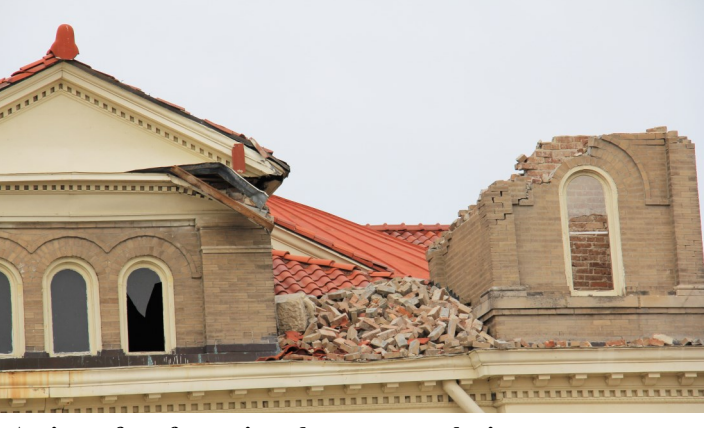
A piece of roof was ripped away over the jury room.