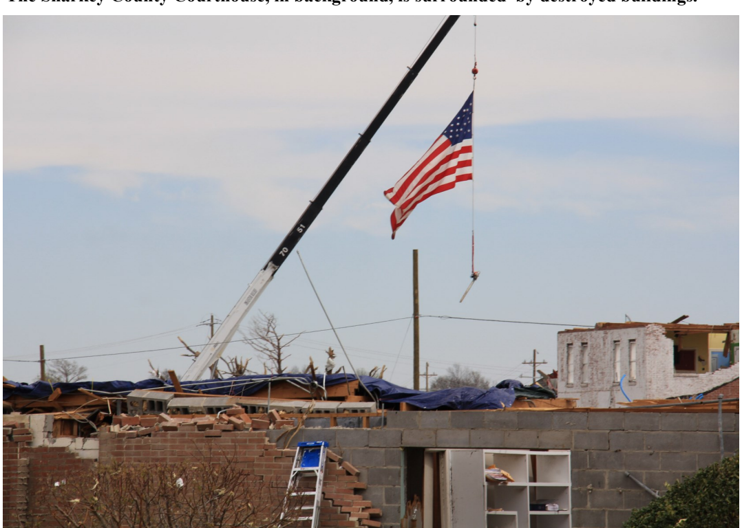
The American flag flies, suspended from a crane, over damaged buildings in Rolling Fork.