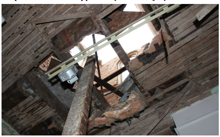
Daylight streams through a hole in ceiling above jury room.