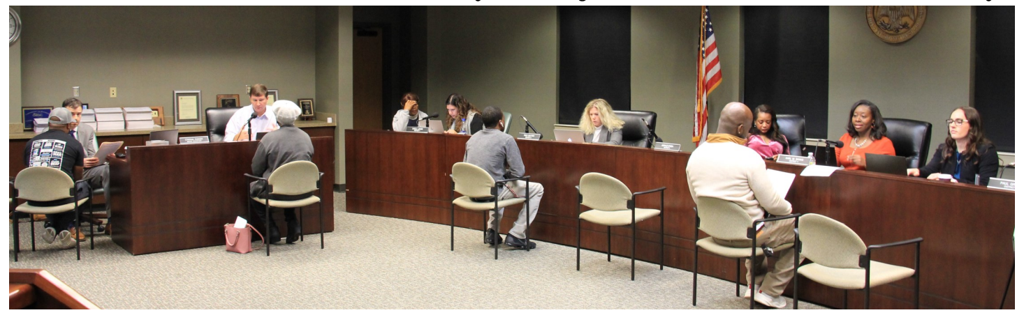
Volunteer attorneys provide free legal advice to low-income people during a Jan. 20 family law clinic for the 11th Chancery.